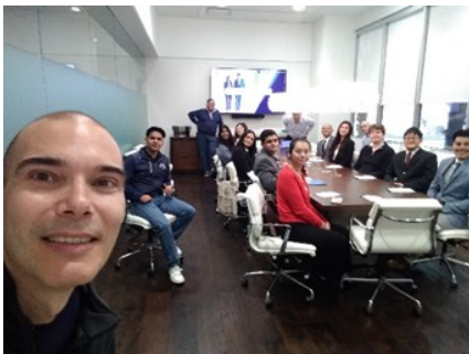
Western Alliance Bank Tour (4/17/2026)