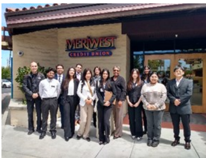
Meriwest Credit Union Tour (4/24/2026)