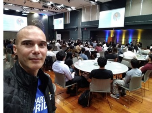
2026 CBFS Technology Credit Union SJSU Alumni Association Networking Success with Executives