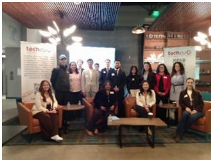
Technology Credit Union Tour (3/13/2026)