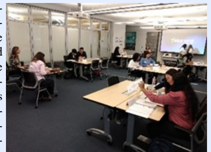
(Picture on the left, certificate recipients, picture on the right, students hard at work during competition)

The Mortgage Banking Certificate is organized by Star One Credit Union and CBFS at SJSU. The certificate is a program that exposes participants to residential real estate mortgage analysis, underwriting and approval.