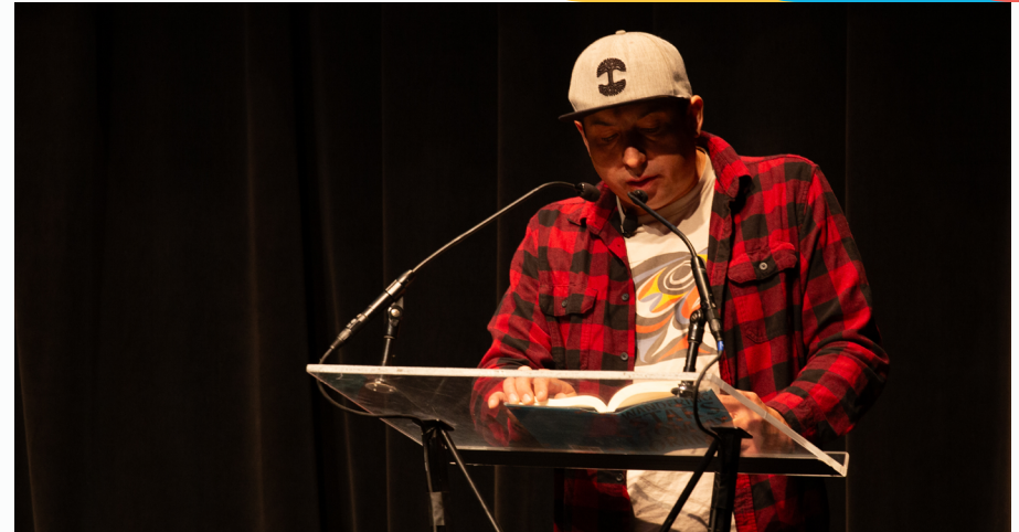
▲ Author Tommy Orange at the Hammer Theatre as part of the CLA Reading Series | December 2024

And our Advanced Institute for Ethical Technology, still not funded after a series of grant writing efforts, has continued to host vibrant events at the intersection of humanities’